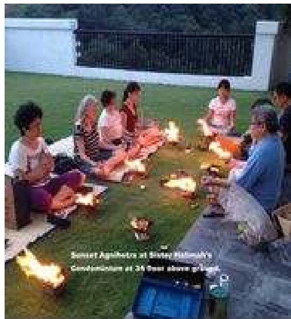
Halimah's home, Kuala Lumpur