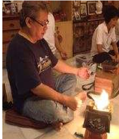
Large gathering at Mantin in Negeri Sembilan , Malaysia