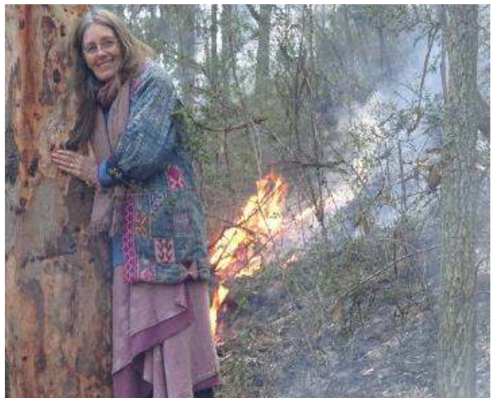
A gentle natural bushfire in the hills surrounding our property