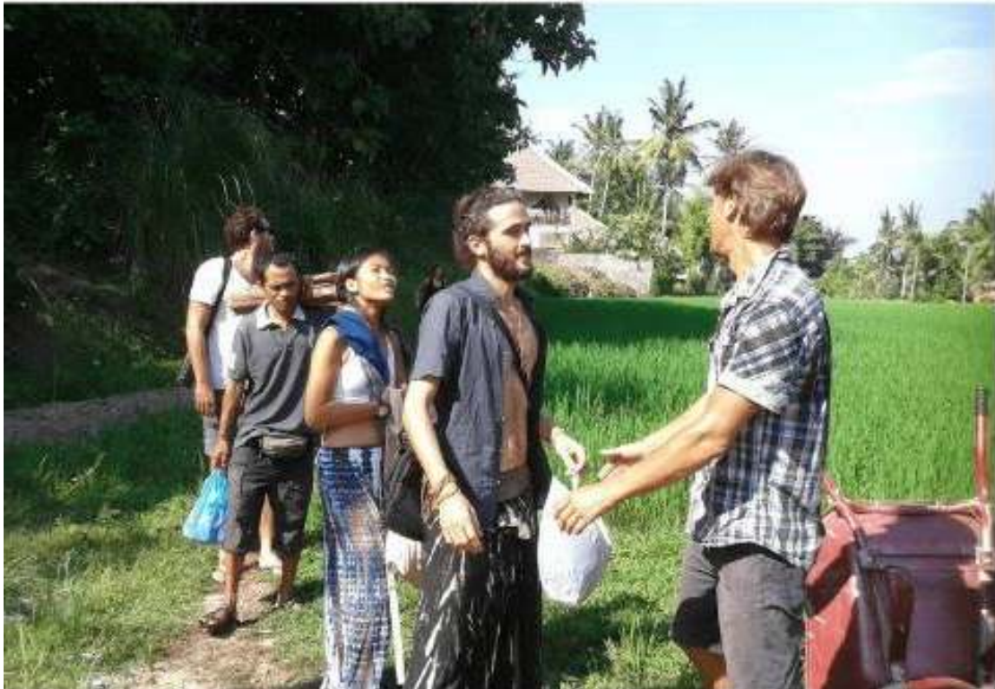
Greetings on the farm with the NewEarth crew

around the world. The NewEarth Nation is actively sharing this knowledge with their community members through http://ArksofFire.com as well as http://NewEarthNation.org