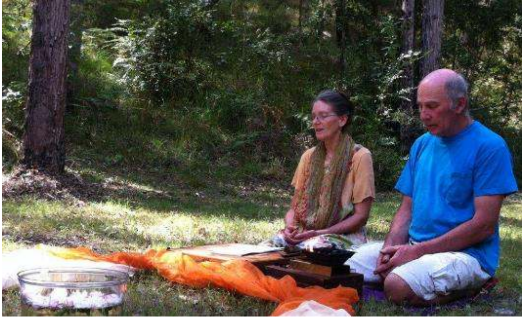
Performing Vyahruti as a blessing for pending motherhood at a gathering at Om Shree Dham