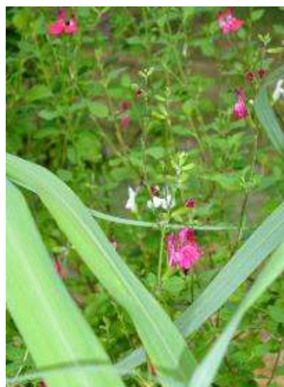
Herbs for our potent herbal teas