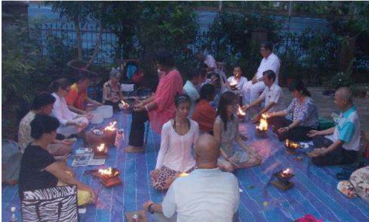
Agnihotra sunset performed for Swami Home for the elderly