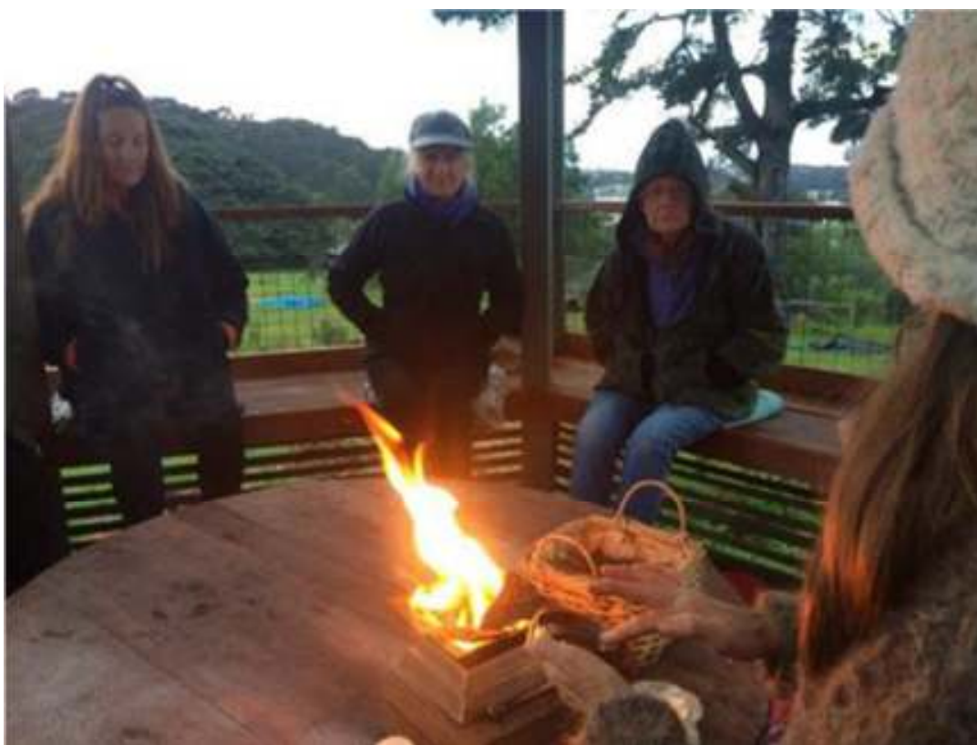
Sunrise at Ecotel Narooma