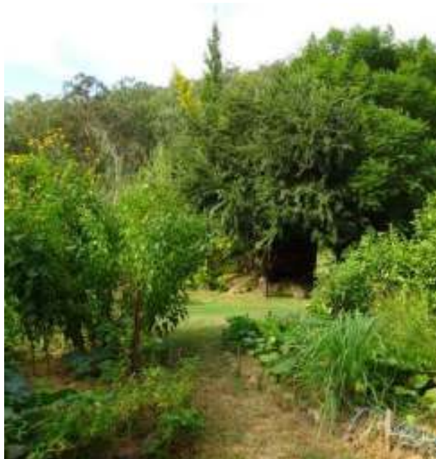
Luscious Homa food garden