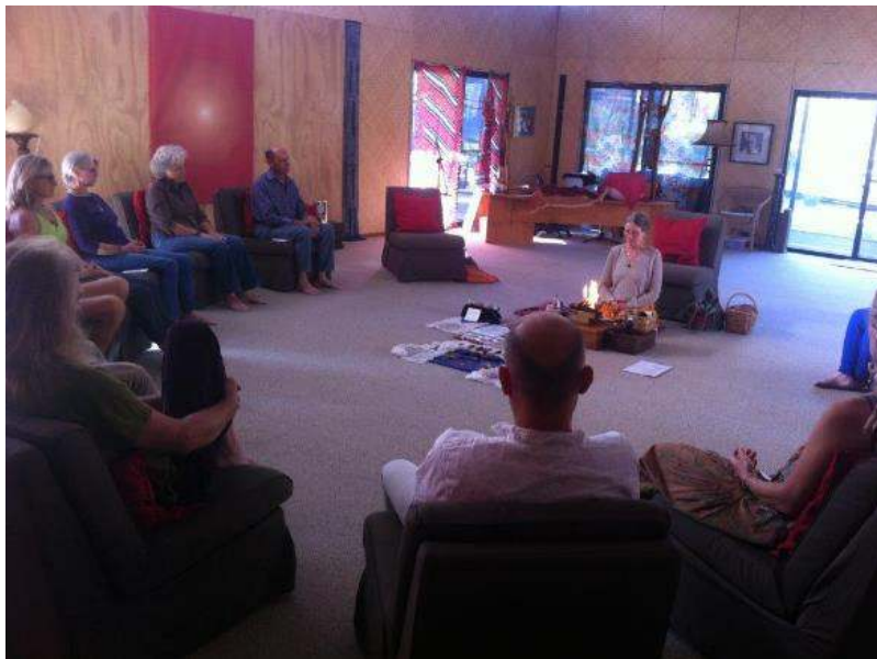
Weekend retreat at The Sanctuary, Glen Innis area

We live in the bush and all of the humans, animals and even the land seemed to have a 'content glow' about them. It feels so beautiful. I also noticed the pot plants that I was using the ash on, were absolutely booming with green leaves and shining like never before. They look sooo happy ! .....When performing Agnihotra I feel a deepened spirit - earth connection and am ever so grateful for the benefits that my family and land receive.” Anonymous, QLD