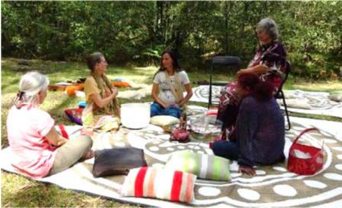
‘Women’s business’ with mother to be