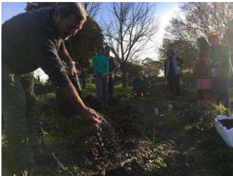
Planting seeds with ash, watering over right hand to Om Tryambakam Homa