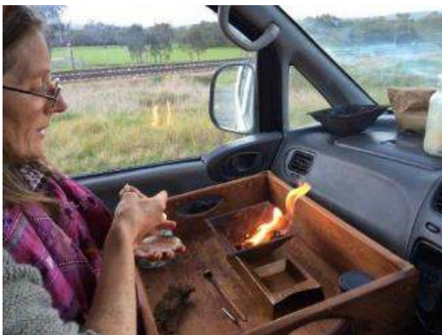
Agnihotra while on the road