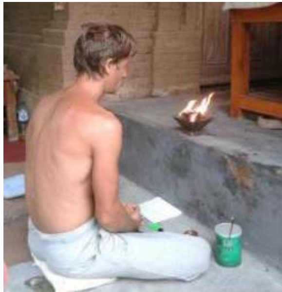
Brother Sky's first Agnihotra in Bali

Author of ‘The Ancient Solution to Modern Pollution’