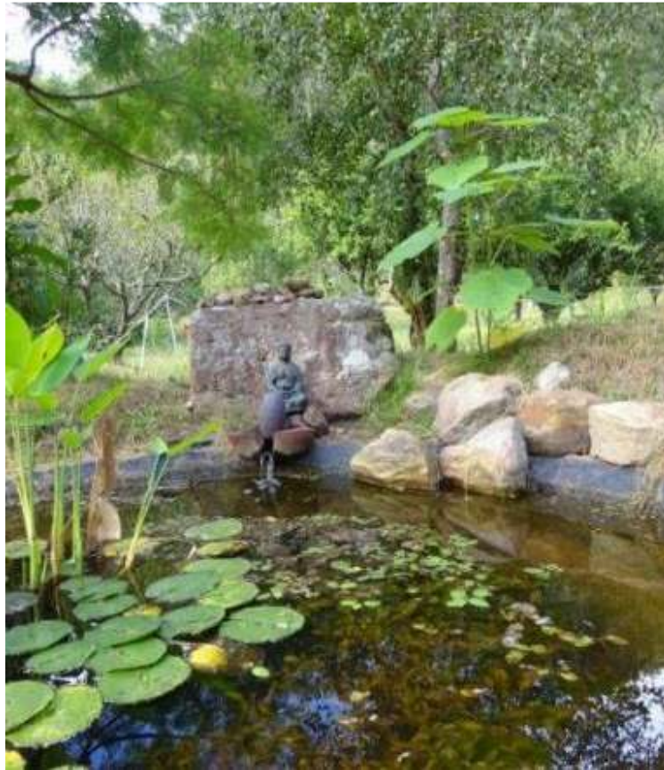
The Buddha Pond