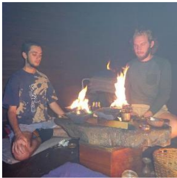
Delicious Organic Vegetarian lunch and delicious nurturing Agnihotra healing twice daily

We regularly travel to conduct free Homa Therapy workshops throughout Australasia. If you are a good networker and would like to host an Agnihotra workshop in your home, Centre or community space feel free to contact us. Ph 02 49981332 e- info@agnihotra.com.au