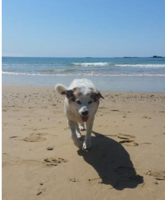
Sol, healthy and happy again