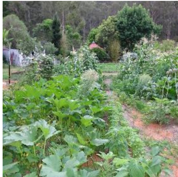
Learning Homa Organic Farming and enjoying the beautiful vitality of Homa atmosphere