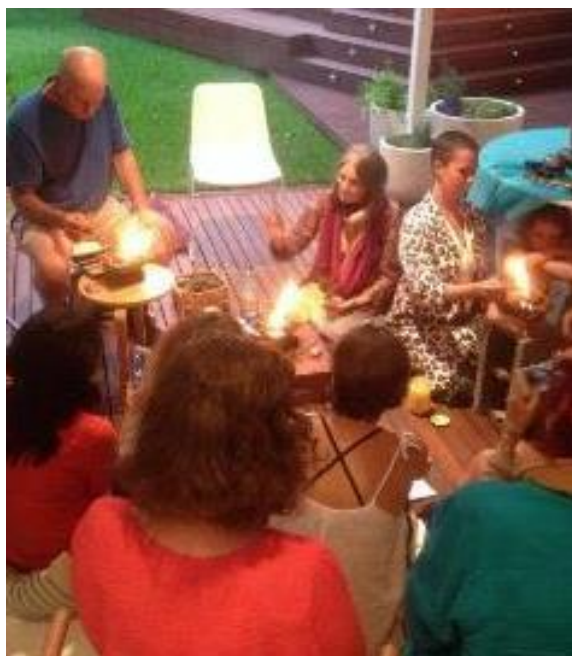
Agnihotra Workshop in Avalon Sydney

You will be receiving an Itinerary for the Nth NSW/Sth QLD Agnihotra workshops by email soon.