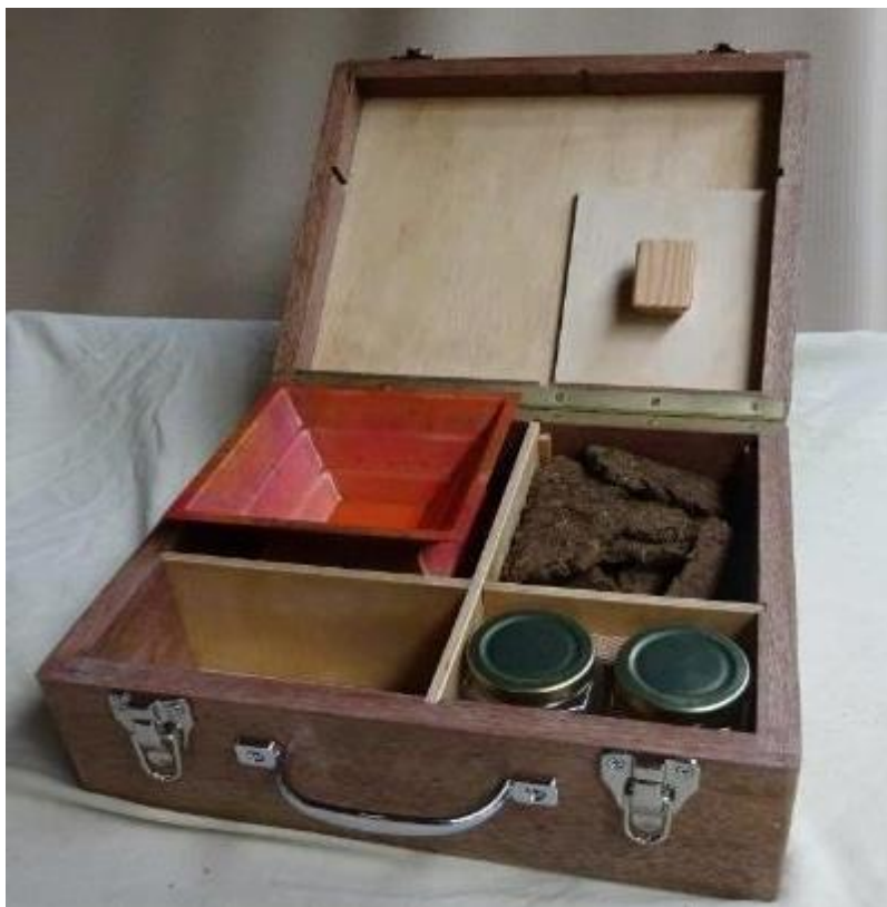
Agnihotra Travel Box, Hand-crafted and made to order