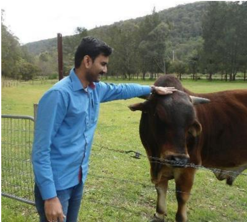
Touring the farm and visiting the V.I.C.'s (Very Important Cows) on an Open Day