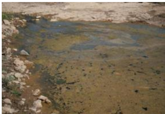
Before Agnihotra Ash had been added