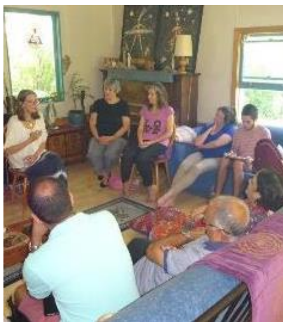
Workshop at Om Shree Dham Open Day