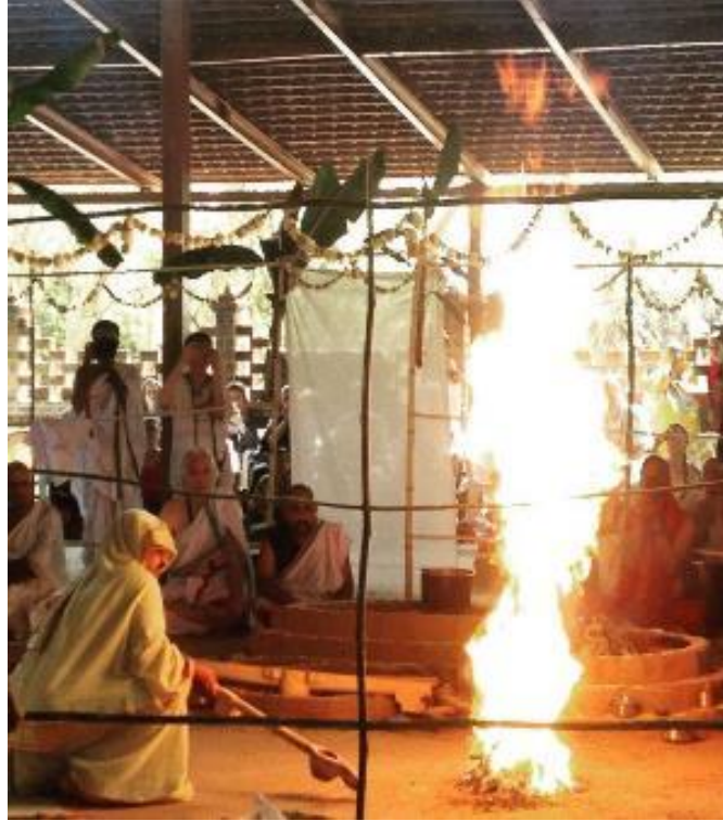
Soma Yag 2017

Younger generation of Agnihotris attending the final Soma Yag