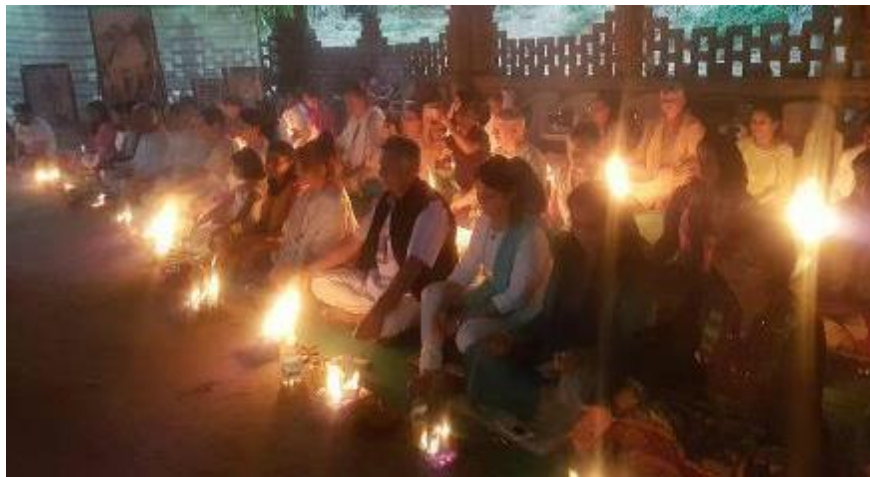
100's of International attendees all performed Agnihotra sunrise and sunset