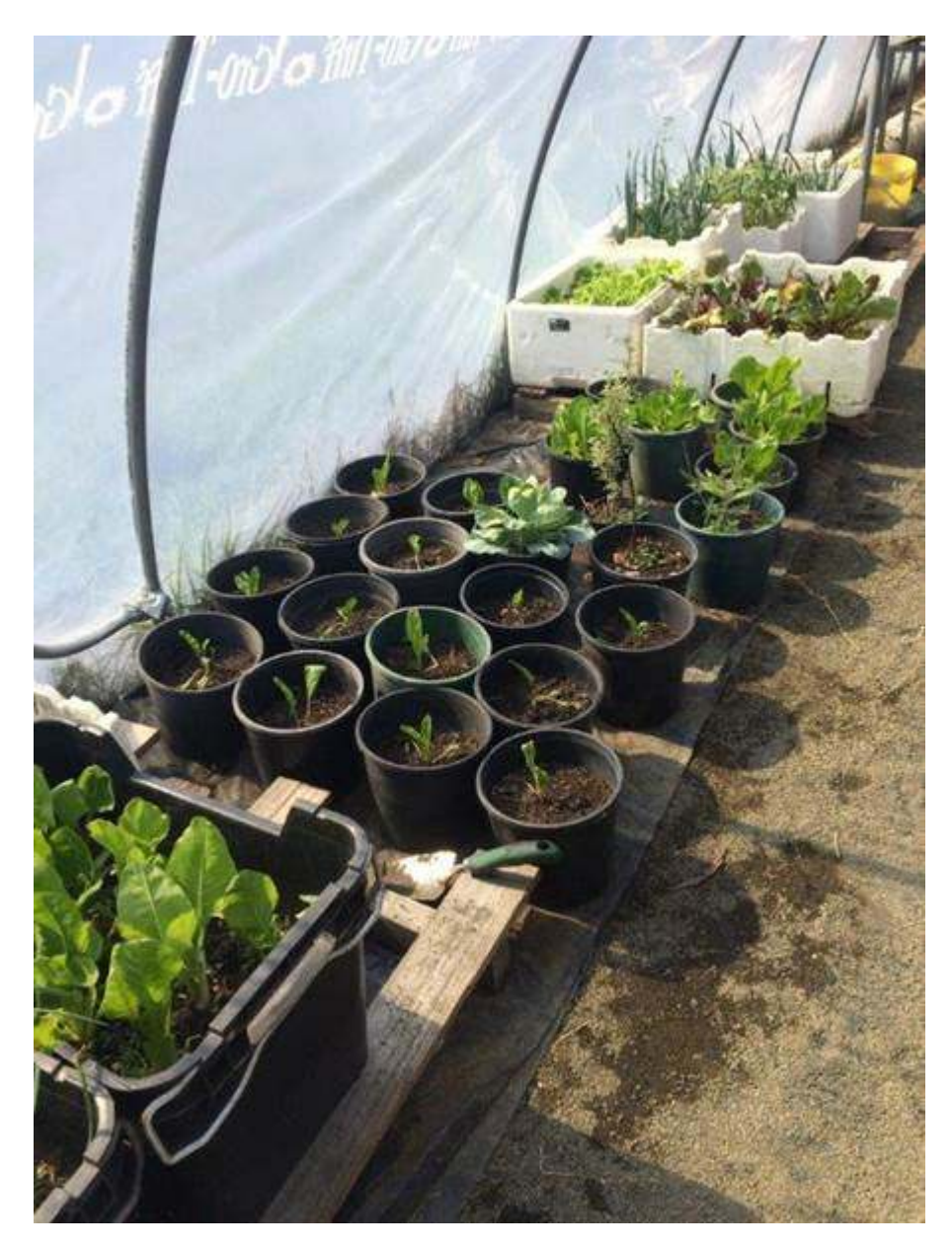
Homa organic veggies grown in the hothouse during the frosty winter and full on drought.