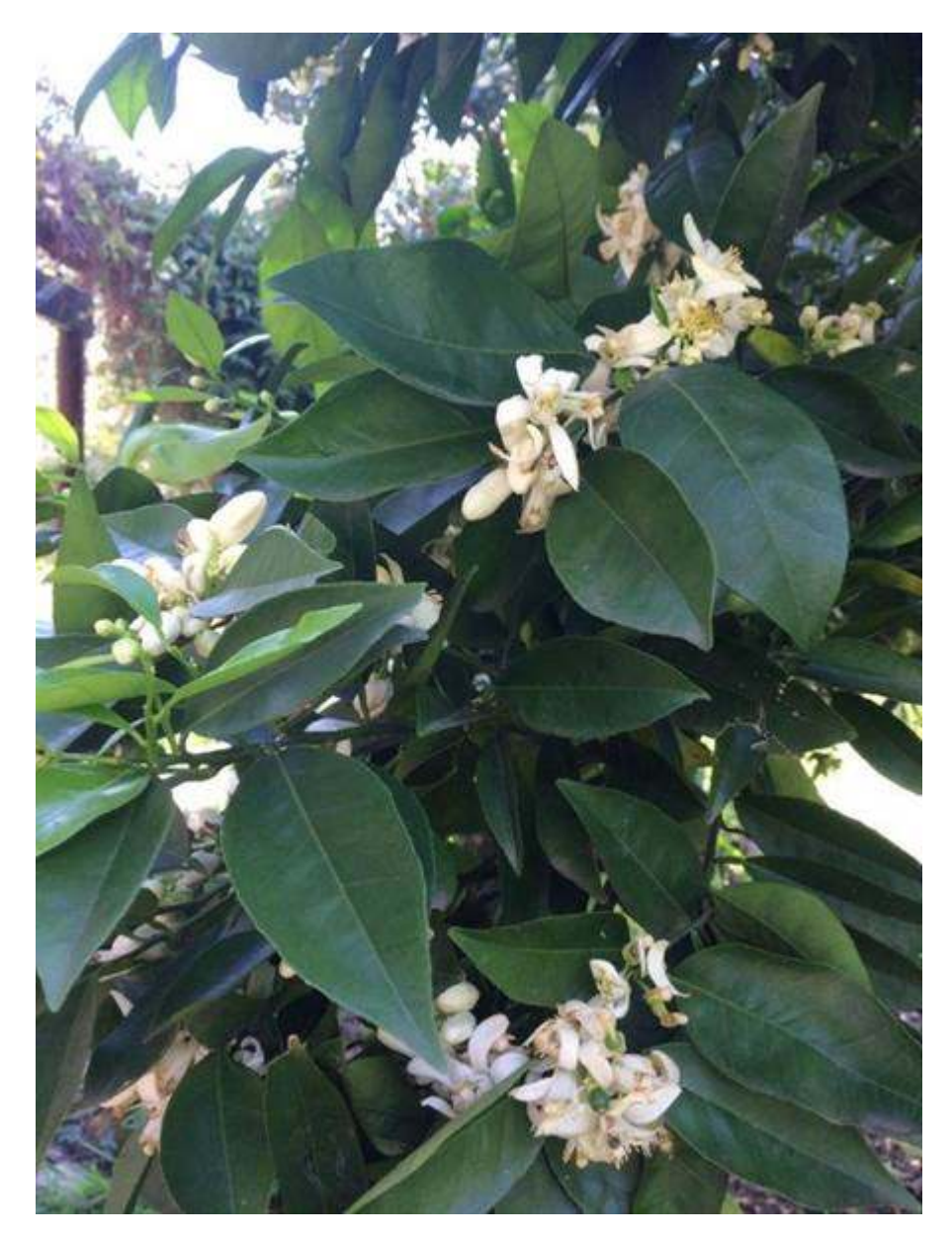
Blissful orange blossoms