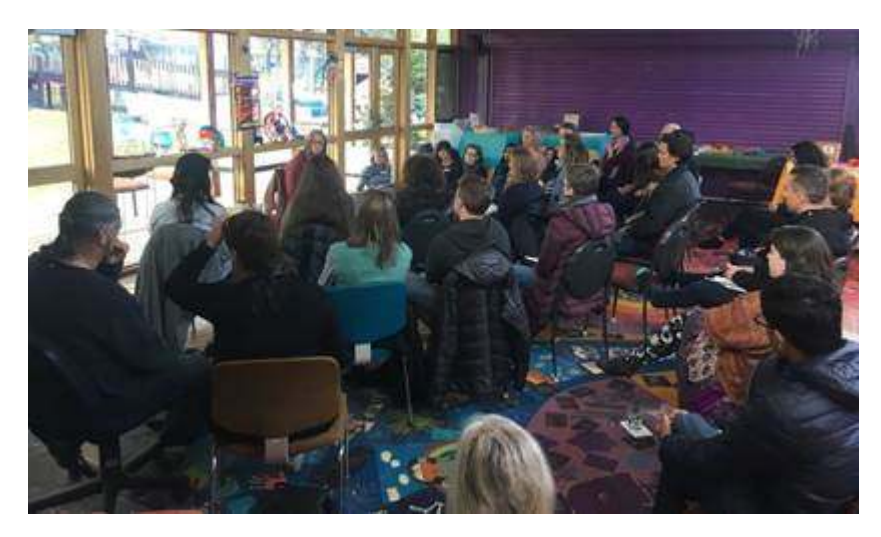
A big crowd came to the Venny to hear about and experience Homa Therapy

After the workshop a level of peace and calm settled on the Venny - I went to do volunteer gardening a couple of weeks afterwards and was hit by the continuing calm that was present. We have done a further Agnihotra at the Venny on the recent new moon and will continue to do it at various events to give the Venny a boost; so not only providing a creative playground and good vegetarian food to the children but also a healing atmosphere.