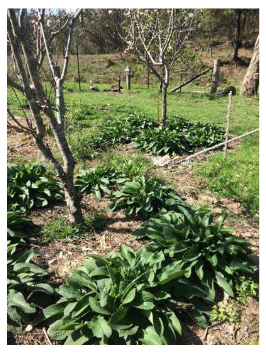
Comfrey, a living mulch under blossoming apple trees