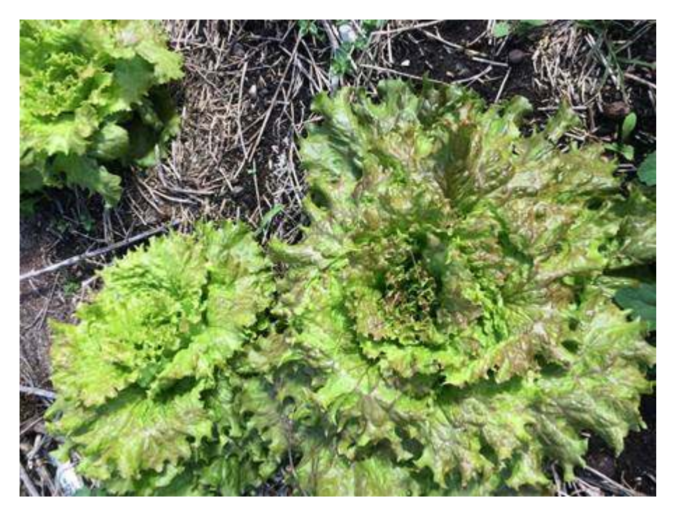
The joy of spring rain enticing self- seeded lettuces to bless us with their vitality and rose like beauty