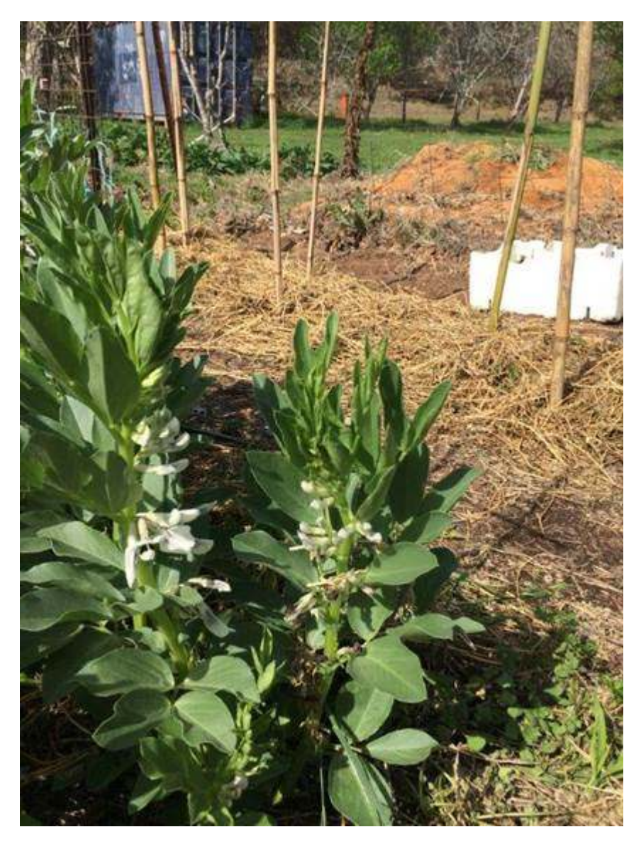
My favourite winter growing veggie- broad beans and the neighbouring beds, mulched and prepared for summer tomatoes and delicious basil.

Warm wishes for a healthy peaceful world,